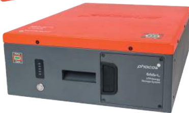
Rack Mount Configuration

Now With Third-Party Inverter Compatibility